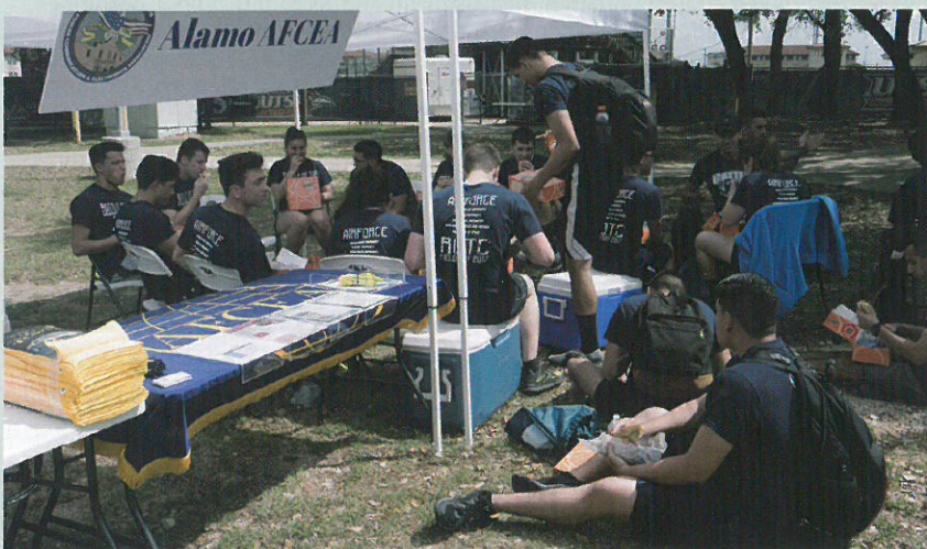
ALAMO —Cadets get some R&R at the chapter's "comfort tent" during their April field day. The chapter provided snacks, drinks and some encouraging words during the annual competition at the University of Texas at San Antonio campus.