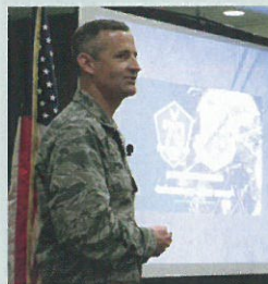
ALAMO —Col. Bradley Pyburn, USAF, 67th Cyberspace Wing commander, discusses cyberspace challenges during the chapter's April luncheon.